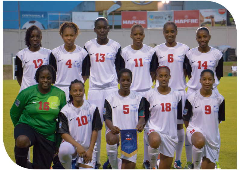
Martinique Senior Women's Team