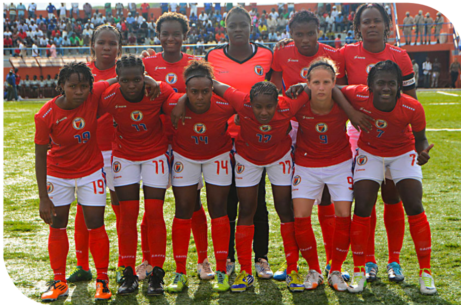
Haiti Senior Women's National Team