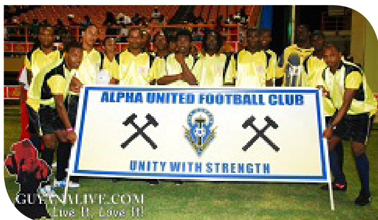
Alpha United FC