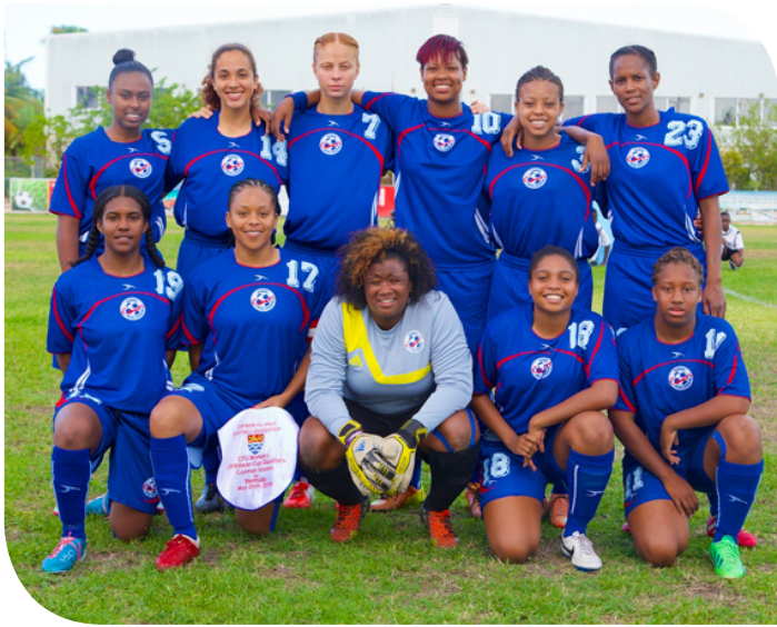
Bermuda Senior Women's National Football Team