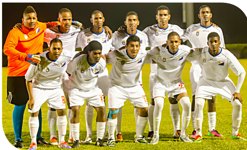
Bonaire National Men's Team