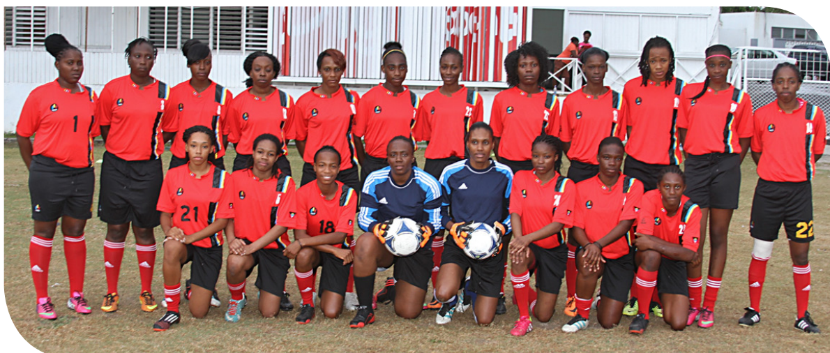
Antigua & Barbuda Senior Women's National Team